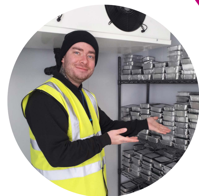
Figures accurate as of 12 May 2020