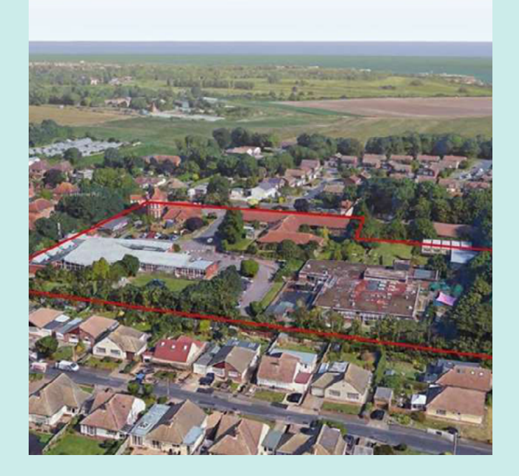
Targeted site promotion to securing planning permission, boosting value of a surplus site

Allocation has now been adopted for a new and improved health accommodation, alongside confirmation of principle of a care-home led redevelopment of 'surplus' parts of the site.