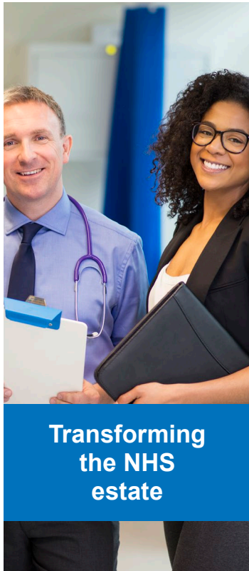
Transforming the NHS estate