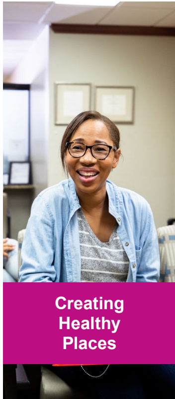
Creating Healthy Places