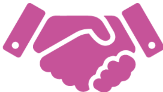
Rental Agreement Letters