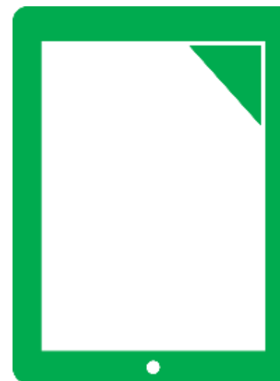
NHS Open Space and Sessional Licenses